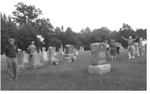
Members of the Italian Club inspecting the tombstones at the San Carlo Cemetery in Herrin, Illinois