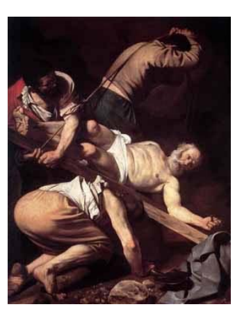
Martirio di San Pietro

Il grande pittore, giocando con una spazialità inedita, riuscì a dare respiro ai due quadri, costretti nell'angusto spazio della cappella. Trasgressivo e anticonformista come sempre, Caravaggio, nella Conversione di San Paolo , usa il cavallo come elemento dirompente del quadro e lascia in secondo piano la figura del Santo; mentre nel Martirio di San Pietro la linea diagonale creata dalla disposizione della croce determina il forte coinvolgimento dello spettatore.